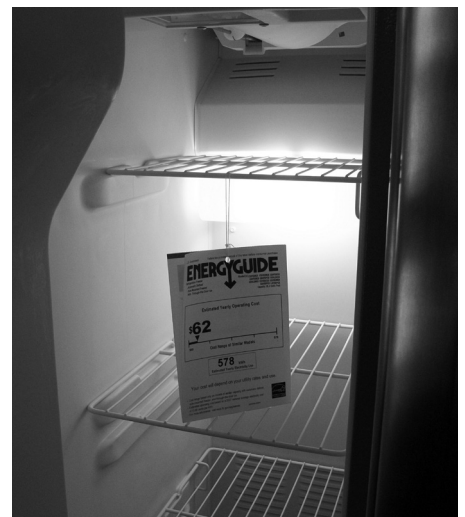
According to EnergyStar.gov, Energy Star-certified refrigerators are about 9% more energy efficient than models that meet the federal minimum efficiency standard.